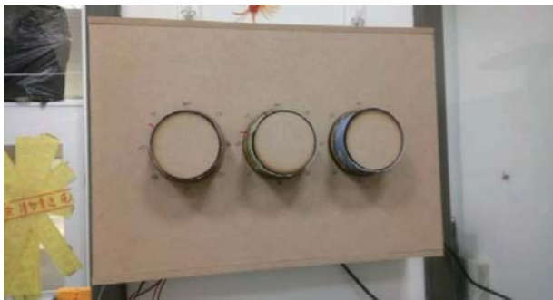
Fig. 3 Design Work by Group C

(14) Total points (Overall Assessment): 30.