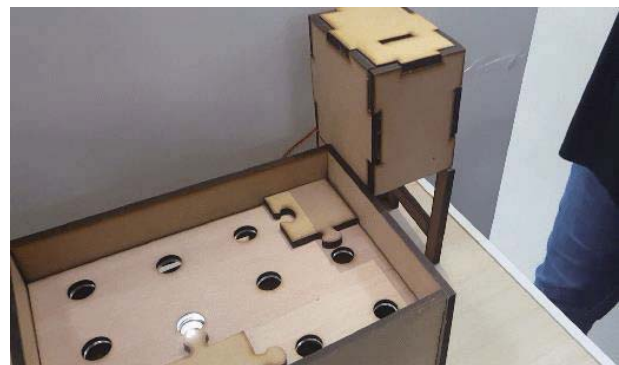
Fig. 1 Design Work by Group A